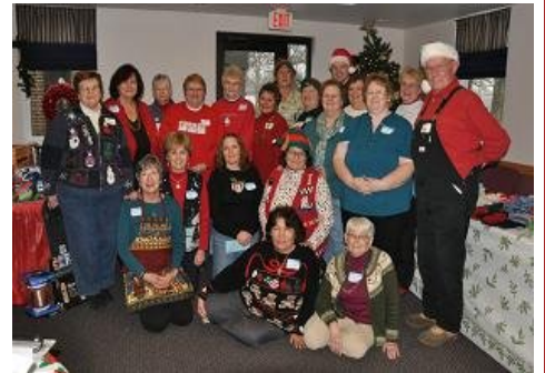
The Project Santa crew.