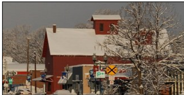
The Bangor Grain Elevator

The Bangor Grain Elevator is going to see more renovations in the very near future. Bob Emmert, co-owner of the Elevator, stated that a heating system is going to be installed in the elevator in the upcoming weeks and he hopes that the project will be complete before the spring so that the building may be used for a business front before the beginning of the summer.